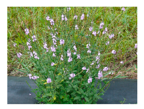
Fig. 1. Typical plant growth habit and inflorescences of gulf vervain.

this species may be an allohexaploid containing multiple subgenomes. In some mitotic cells,